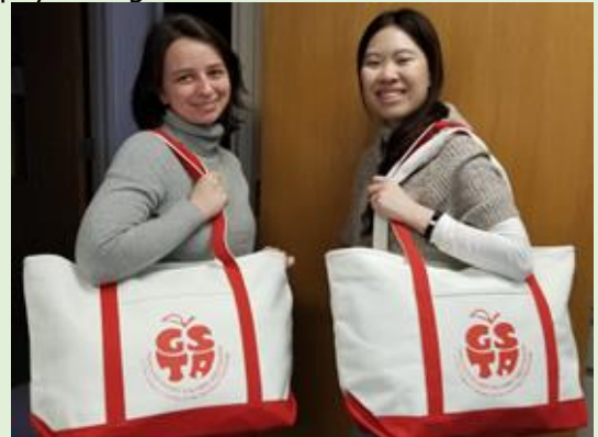
While you're at the meet-up, pick up some great GSTA swag!

GSTA Meet-Up at EPA! Grab a drink and join us at 5pm on Friday, March 1, 2019 at The View on the 48th floor of the New York Marriott Marquis. This is a rotating lounge and a great place to take in the lovely NYC skyline while sharing teaching tips. All are welcome, especially graduate students and early career psychologists!